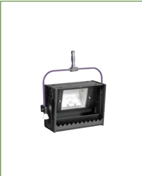
L0100PCT (P.O.) L01000CT