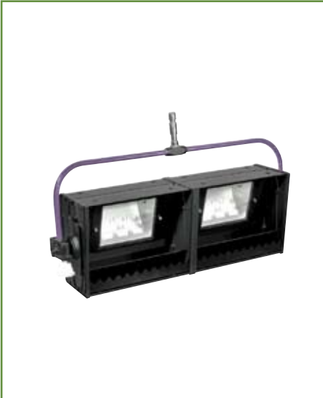
L020HPCT (P.O.) L020HOCT