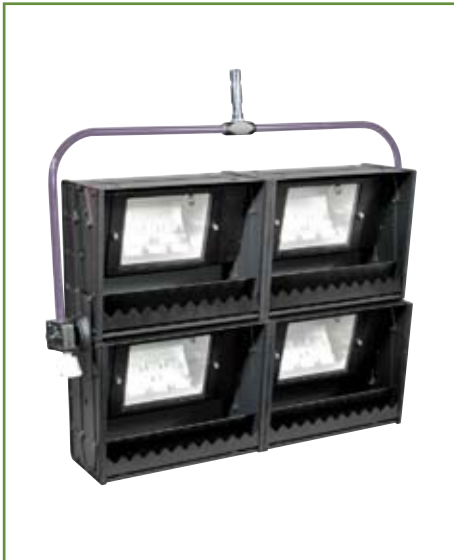
L0400PCT (P.O.) L04000CT